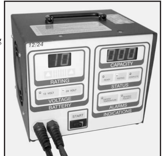
Figure 1 – BC3100-0001 Battery Capacity Analyzer