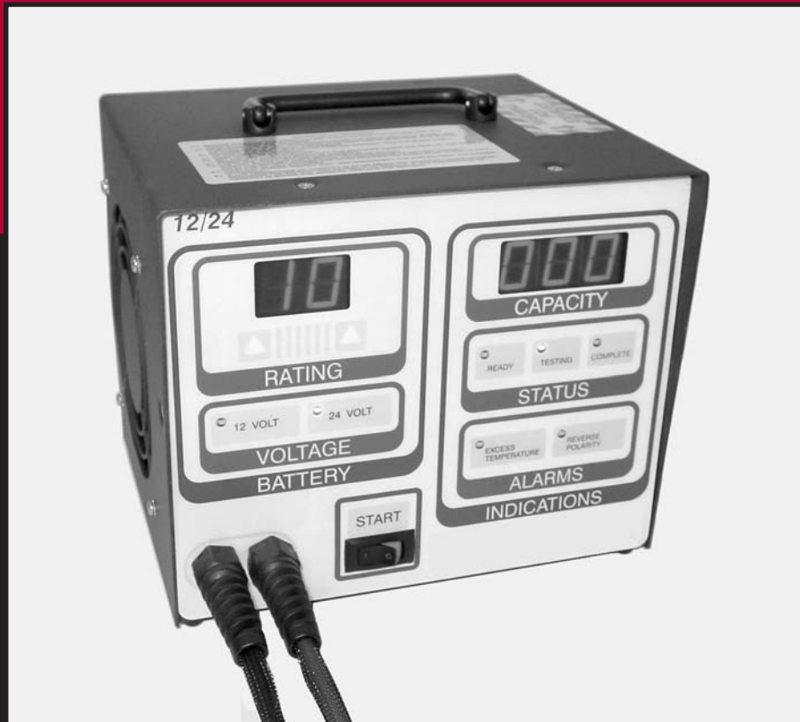
Battery Capacity Analyzer P/N: BC3100-0001 Revision A